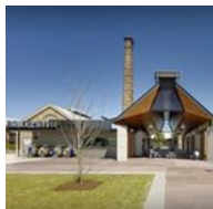
Tanner Architects grows into Tanner Kibble Denton