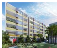
An injection of new DNA into Sydney's inner west