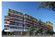
Developers point to growing single household demographic