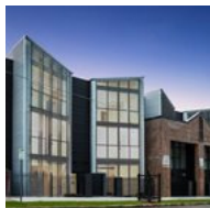
Historic Sydney warehouse transformed into apartments