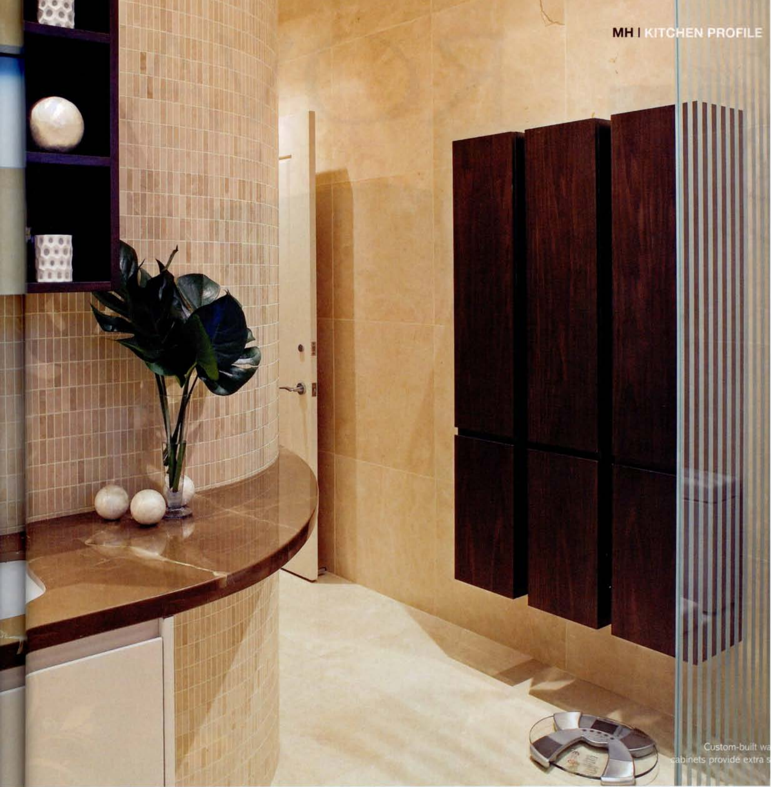
Custom-built wood cabinets provide extra storage.