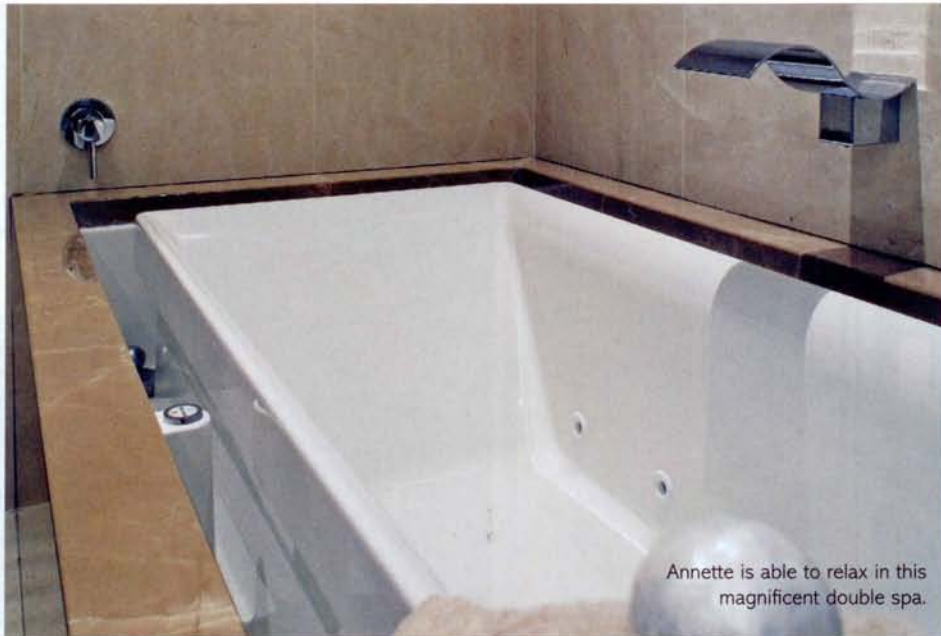
Annette is able to relax in this magnificent double spa.